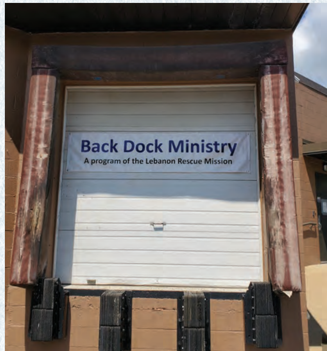
God using small spaces for huge blessings

Stay tuned for more details of this new ministry program here at Lebanon Rescue Mission.