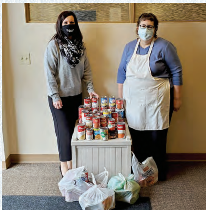
Mobile Senior Pantry