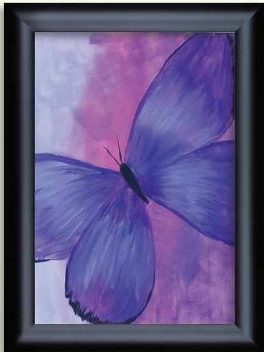
This painting was given to us by one of our patients at the Free Clinic.