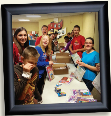
The Lebanon Rescue Mission is very thankful for the many volunteers who come throughout the year. Volunteers of any age are welcome to help in any way they can.