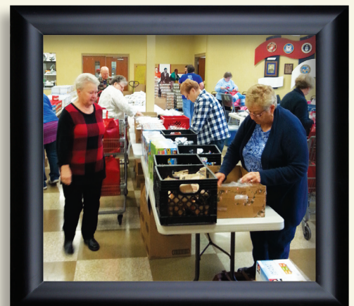
An army of volunteers carefully and lovingly packed all the Agape Christmas gift bags and enjoyed doing it.