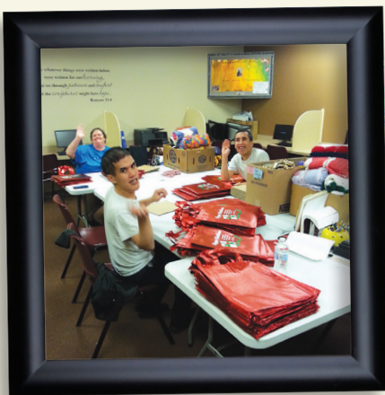
Volunteers from Quest, Inc. helped assemble the gift bags ... "Many hands make light work".