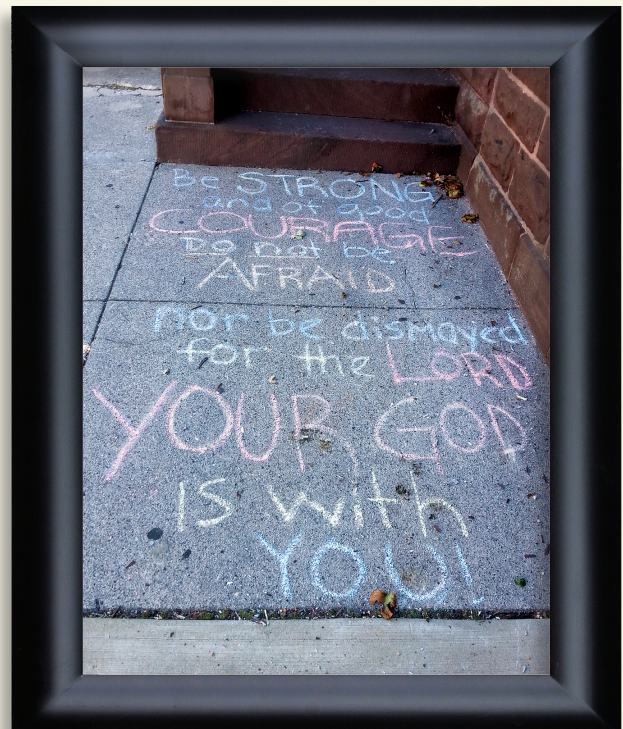
Message of love left outside our Clinic.