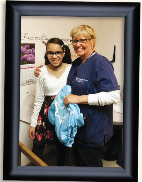
Students from the Lebanon school district were able to have their eyes tested and receive eyeglasses if needed — donors like you made it possible!