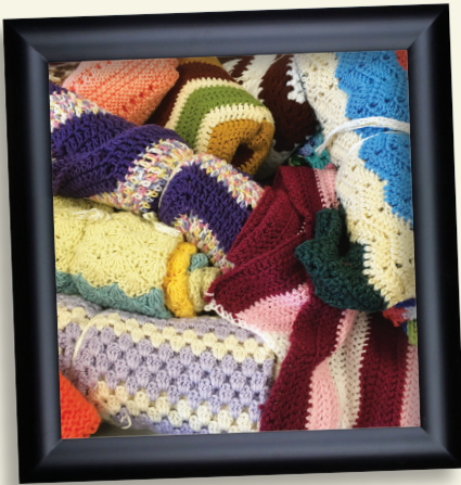
Handmade with love.

Take a look at these pictures. In nearly every gift bag you'll find food, greetings, care items, and on top, a handmade lap throw. These Christmas packages brought tears to many seniors in our community, who can be forgotten at Christmas. Knowing someone cared so much to put these beautiful packages together for them, including a one-of-a-kind lap throw, caused many to break down in tears.