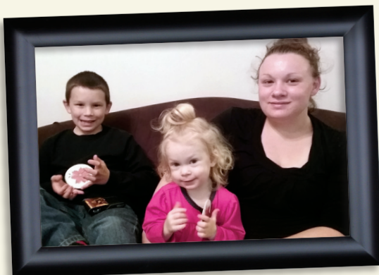
Families in need of help can stay together at the Agape Family Shelter while pursuing independent living.