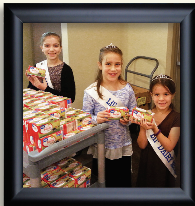
These happy junior representatives of the Pennsylvania Dairy Princess & Promotion Services, Inc., lit up our lives with their smiles and their donation of over 660 pounds of butter — one pound for each bag. You are true Princesses. Thank you!