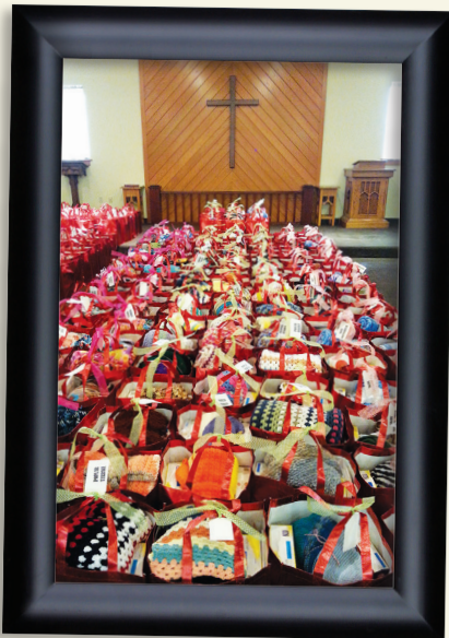
A portion of the 660 hand-delivered bags.

Thank you, each and every one, who volunteered and donated. You made Agape Christmas a big success. You blessed many who will remember your love for a long time.